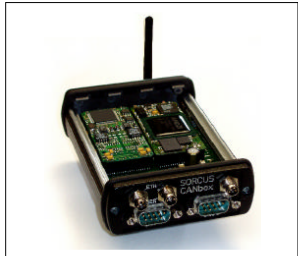
Fig. 1: CANbox ®

Errors and technical improvement may change these data.